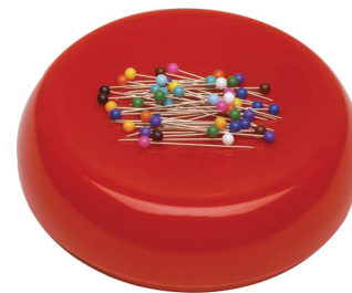
Grabbit® Magnetic Pincushion