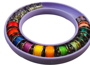
BobbinSaver™ Bobbin Holder